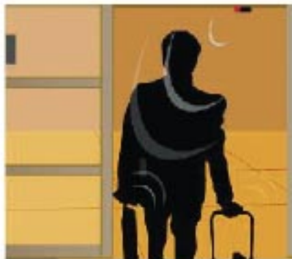
Figure 8: RFID enabled exit system at the Airport