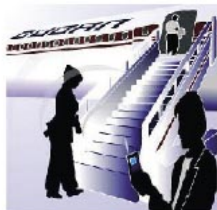
Figure 3: RFID implemented passenger-boarding process

that the boarding gate will close in x minutes. The system will also notify the airline personal, as to the last checkpoint the passenger cleared, enabling the airline employees to physically search for the passenger.