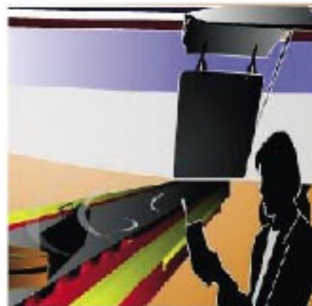
Figure 4: RFID enabled baggage loading process