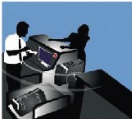
Figure 2: RFID based Boarding Pass Generation

These details are associated at the secure master database level with the serial number of the RFID tags simultaneously as the employee is generating the boarding pass. Both the passenger and the baggage are tagged and associated with each other.