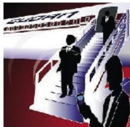
Figure 5: RFID enabled disembarking process

validated to check for the presence of any unauthorized passengers who might have traveled or passengers who would have disembarked erroneously on some other port. In case of any discrepancy, alarms are generated.