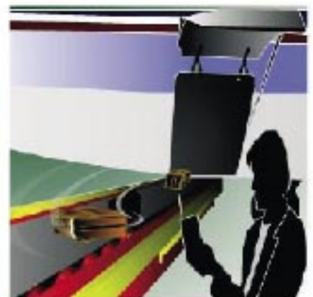
Figure 6: RFID enabled baggage-unloading process