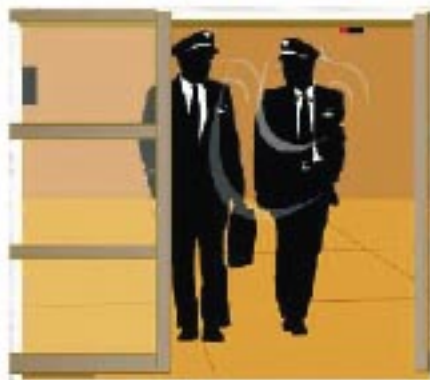
Figure 1: RFID implemented process at the Airport entrance