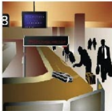
Figure 7: RFID enabled baggage collection process

tags on them and this information is displayed on an overhead monitor. The monitor can display the name of the baggage owner through the association created earlier.